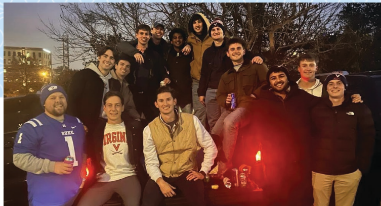
Our fourth-year Brothers (and an intruder) are happy and hopeful at the ACC Championship game in Charlotte. That jovial mood dissipated in overtime.